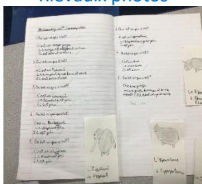
Alban's French work using adjectives to describe animals.