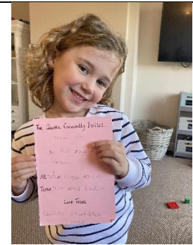
Rosie's super party invitation from the queen. Rosie always works so hard