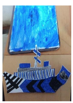
Summer worked extremely hard as always, in ALL areas of the curriculum. Here is her painting of a WW1 Dazzle Ship.