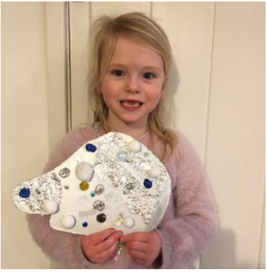
And her design for Buckingham Palace.